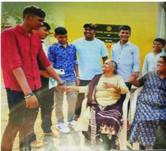
Pune Rotarians gift a home for the homeless children